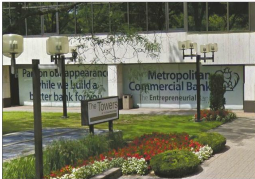
Metropolitan Commercial Bank's new Great Neck location at 111 Great Neck Road

"We have a lot of clients of the bank that actually live in the Great Neck area, so we felt it was an opportunity for us to extend our relationship with these clients to set up a center in Great Neck," she said. "A lot of them work in Manhattan and live in the area and it's a good opportunity for us to build these relationships. It